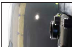
Marked transparent window showing sand level.