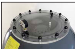
A Ø400 lid in reinforced PP for all models (available also in non-transparent version)