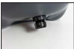
A larger filter drain of 1¼" for faster emptying